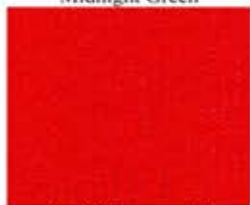
Red (Polytex only)